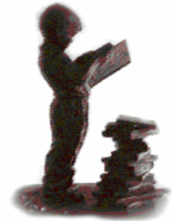
“The Bookworm” An original sculpture by Gary Price